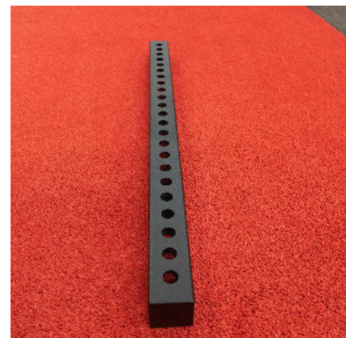
Non Offset 1" Holes on all 4 sides