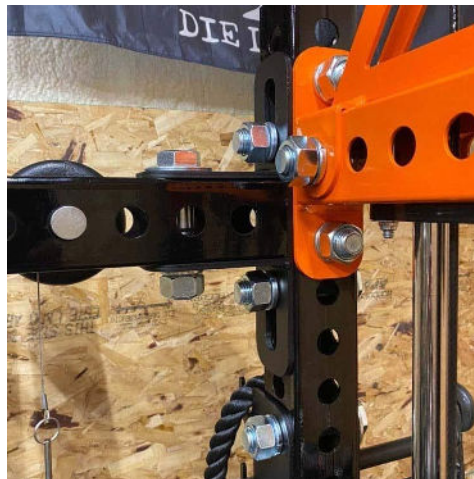
Connected to ATR Cable Column