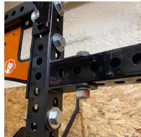
Connected to Rouge Monster