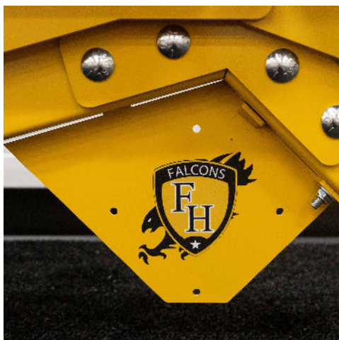
Bolt On Logo Plate