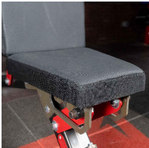
12.5" x 12" Pad