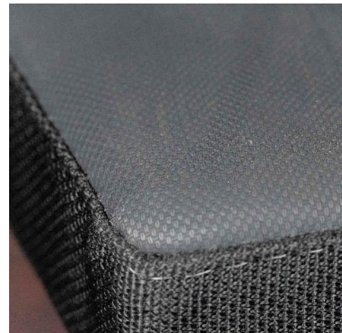
Grippy Option Available