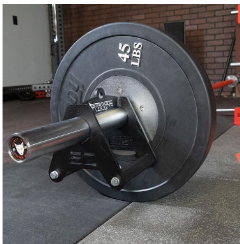
Add to Bar for Landmine Movements