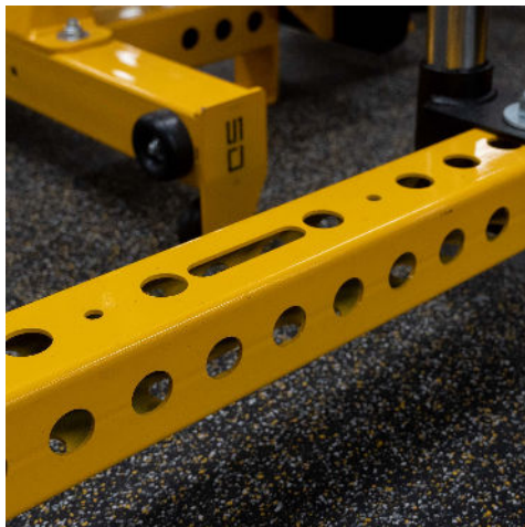
Machine Add on Hole pattern