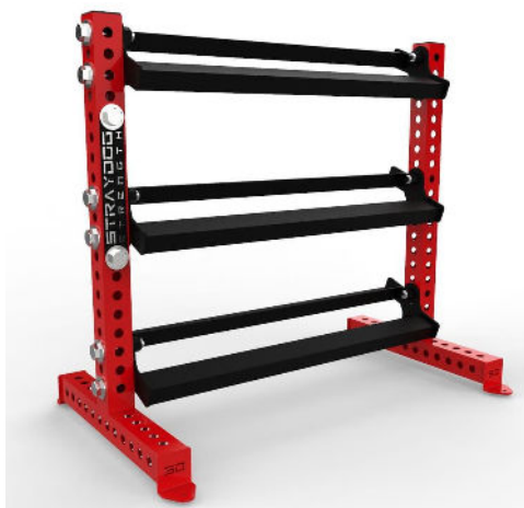
3 43" Trays