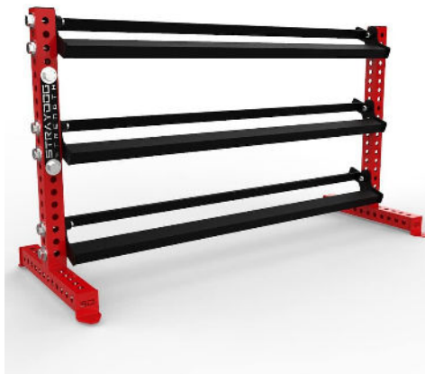
3 72" Trays