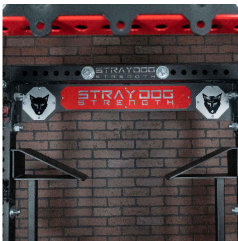
Laser Cut Logos