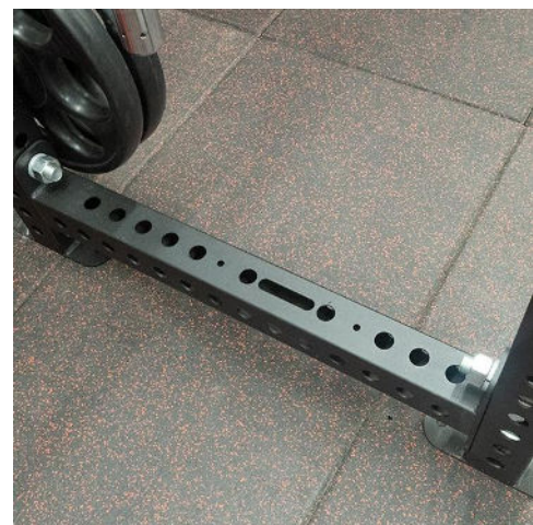
Crossmember Machine Hole Pattern