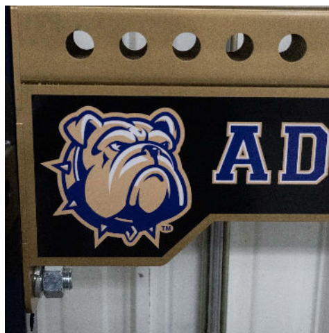
Use multiple colors