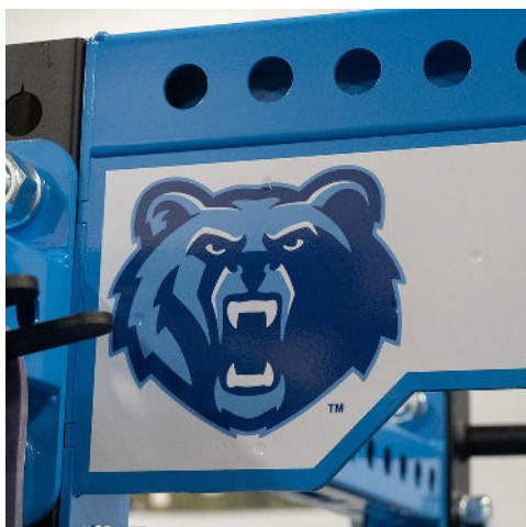
Decal Can be very detailed