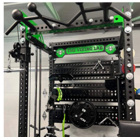
Custom Colors Available