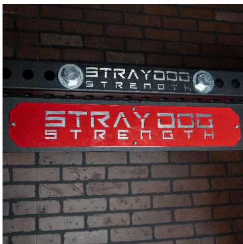
25"x 4.5" Rectangle (Words)