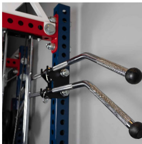
Lat Bar Storage (deluxe)