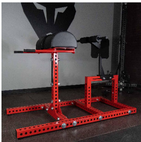
1" holes all over