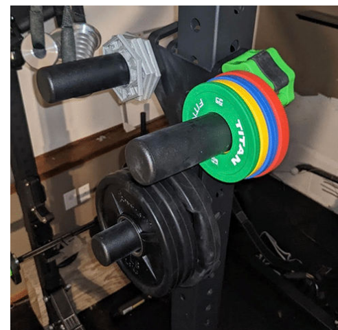
Fits on 5/8" Rack too