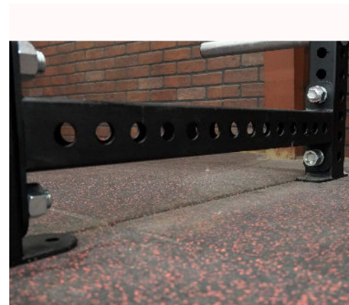
3.75" underneath for feet