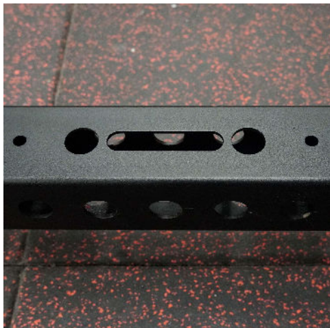
Guide rod hole pattern