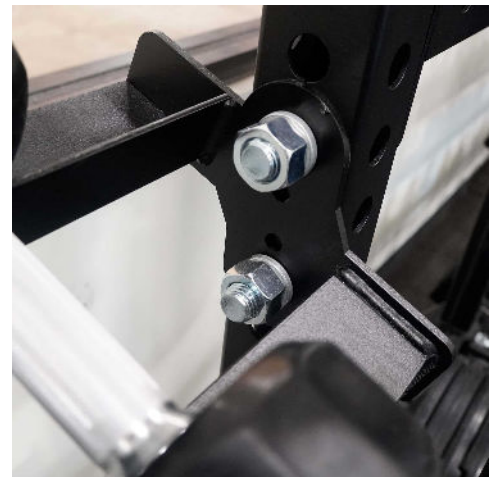
Sticks 4" out back