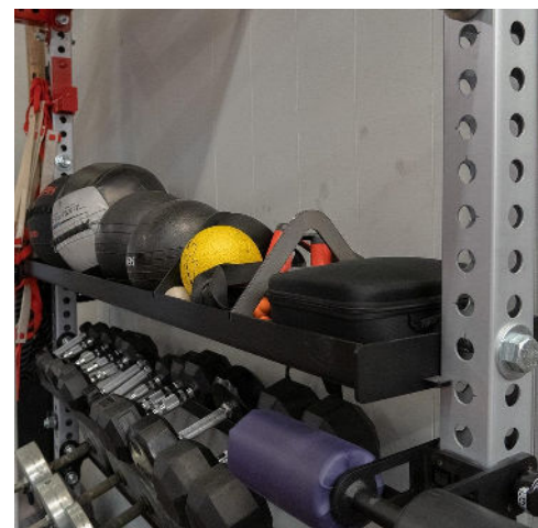
72" Trays have 5 Slots