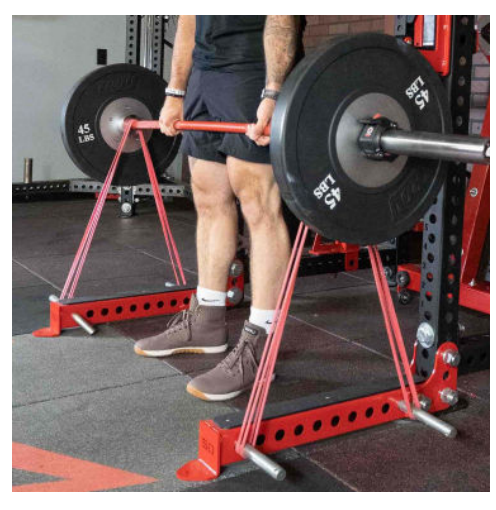
Attach to Rack or ATR