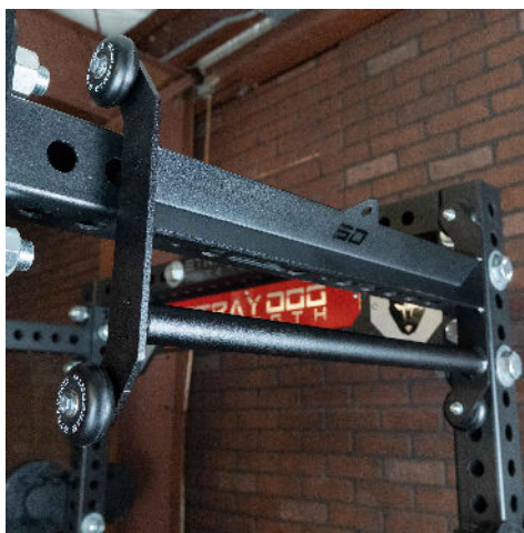
Built in storage tabs for 1" Crossmembers