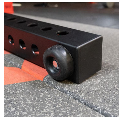
Bumper to protect upright