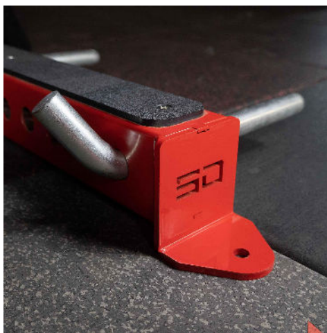
Bolt Down Tab