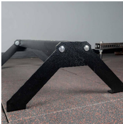
Bolt together construction