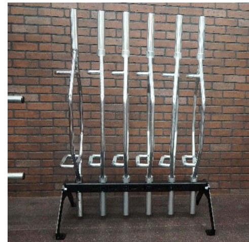
Bars don't touch ground