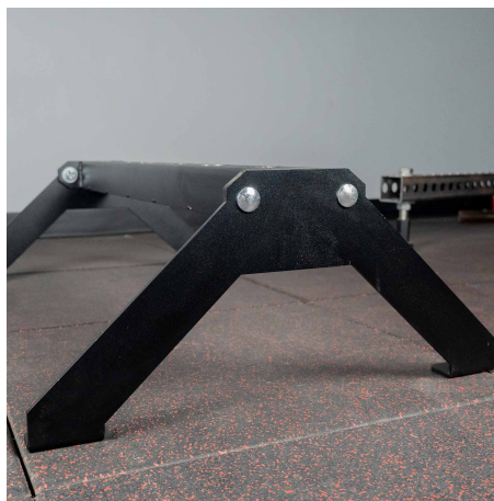
Bolt together construction