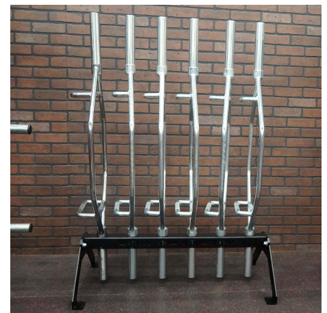
Bars don't touch ground