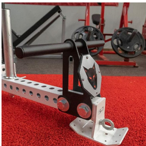
Bolts on with 2 Bolts