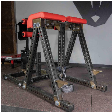
1" holes spaced 2" all over