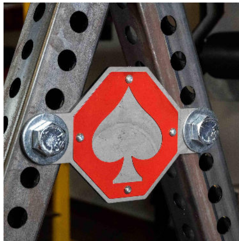
Add on Logo