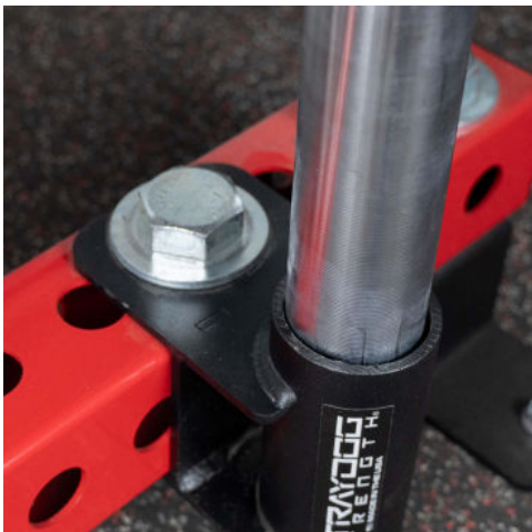
Bolt onto any 1" hole