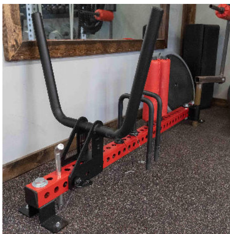
Store Attachments or Bars