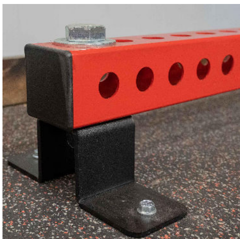
Bracket puts tube 3" off ground