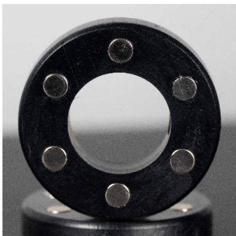
6 1/4" Neodymium Magnets