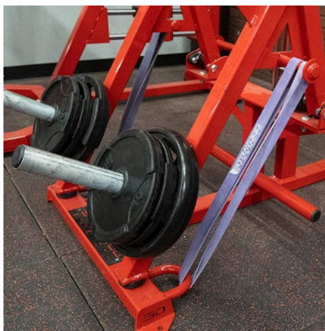
Band Attachment Peg