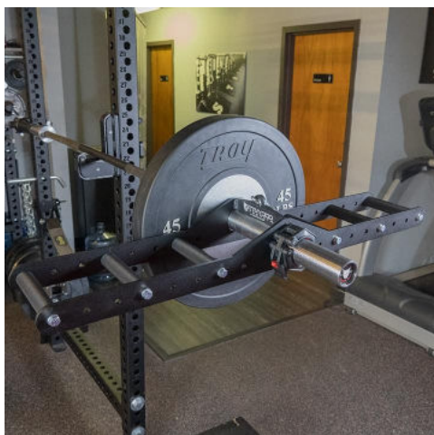
Landmine Hole for 2" Bar (No Plastic)