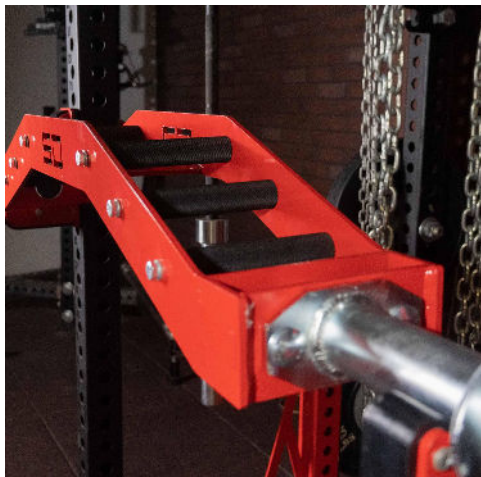
Color Options Available