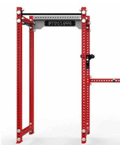
Alpha Half Rack