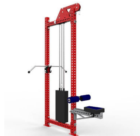
ATR Lat Pull Down