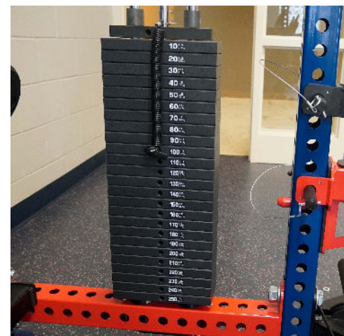
1:1 Ratio weight Stack