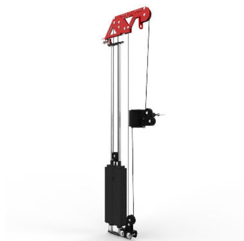
Add Machine Attachments