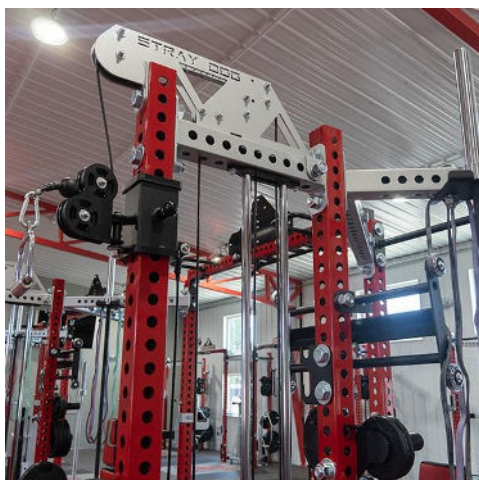
Pulley housing is accent color