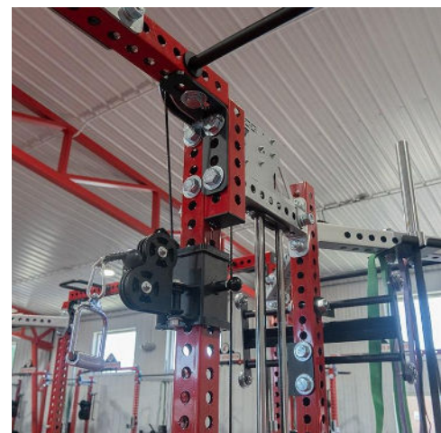
Trolley is always black