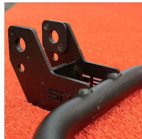
1" and 5/8" hole