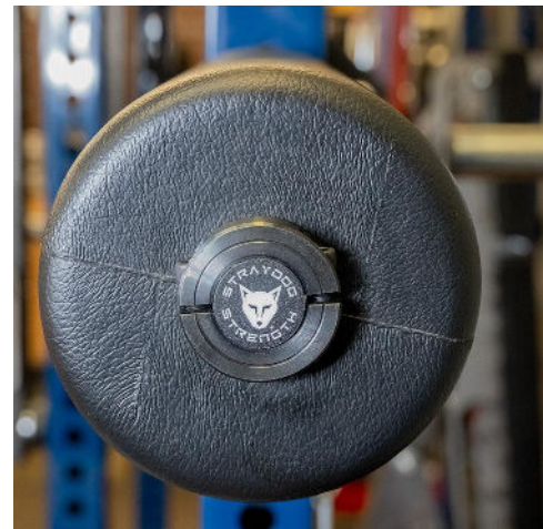
Injection Molded Foam Pad