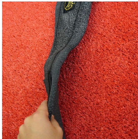
Thick yet flexible webbing