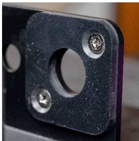
plastic pieces for post protection