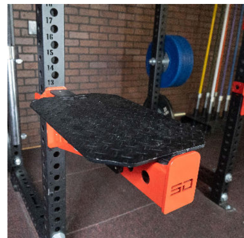
Attaches to spotter arm