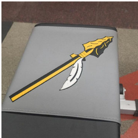
Choose Upholstery Color