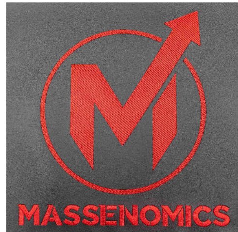
Ability To Replace overtime