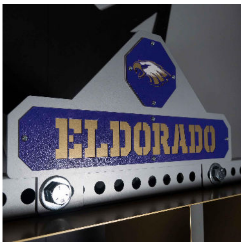
Laser Cut Logo Topper

The Storage Cubbie units were designed to be a storage unit for personal items for athletes, each cubbie is 24"x 24" and has a 50 LBS capacity per shelf. They come with a custom Laser Cut Logo Topper and custom colored tubing and cubbies. This unit must be bolted down as we wanted to keep it as shallow as possible to have a smaller footprint.