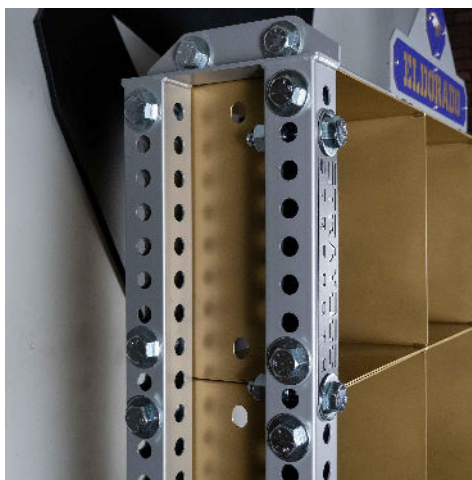
3x3" Tubing All Over