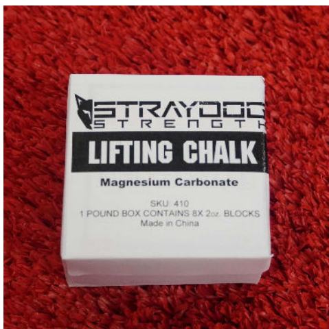
2 OZ Blocks

Magnesium Carbonate is widely used because of its moisture fighting qualities. Use these as a drying agent for your hands from sweat and also as a protectant against torn hands. Magnesium carbonate is also non-toxic.