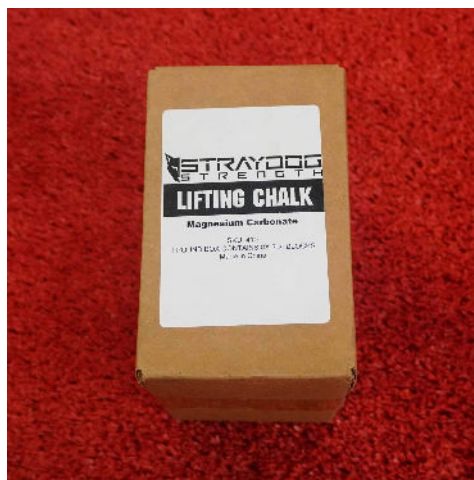
8 Blocks per box