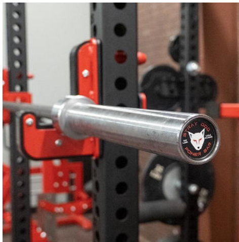
Zinc Coated Silver Sleeves