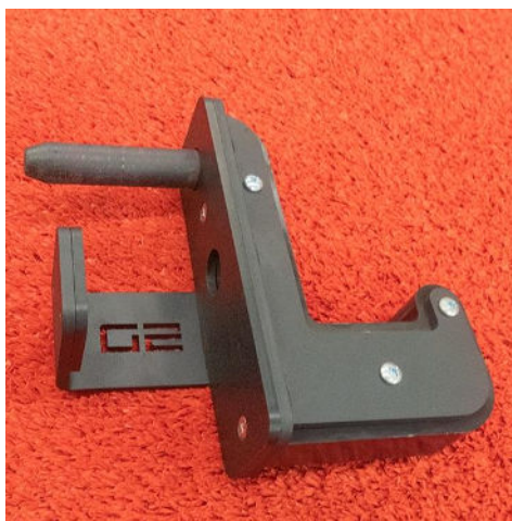
Plastic To Protect post