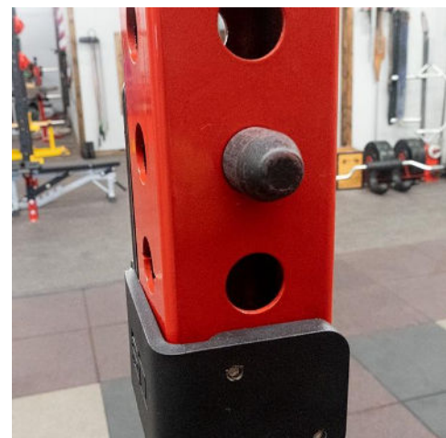
Tapered Pin for easy adjustment