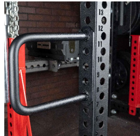
Solid 1" Steel Tube