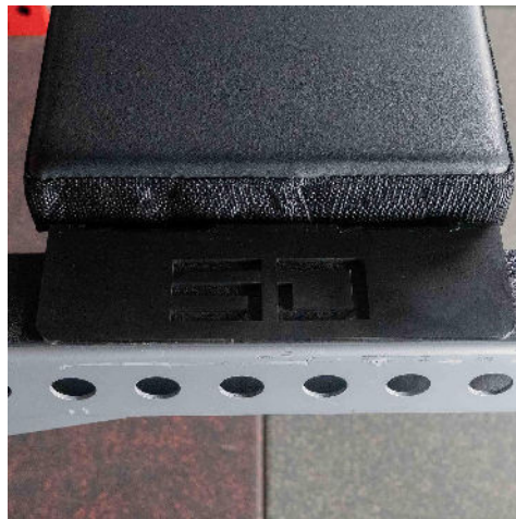
Laser Cut Logo