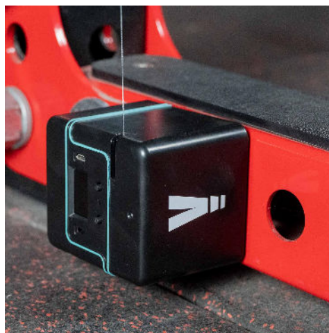
Add To Rack